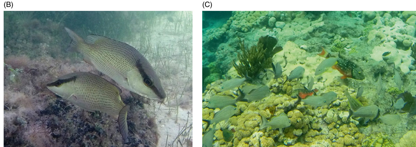
FIGURE 1.2 Fish versus fishes. By convention, "fish" refers to one or more individuals of a single species. "Fishes" is used when discussing more than one species, regardless of the number of individuals involved. (A) One fish, (B) two fish, (C) multiple fishes. (A) G. Helfman (Author); (B, C) D. Facey (Author).